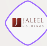
Jaleel Holding Group (United Arab Emirates) Audit and Assurance