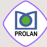
Procesadora Laran Sac (Peru) Audit and Assurance