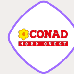
Conad Nord Ovest Societa' Cooperativa (Italy) Audit and Assurance