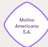
Molino Americano S.A. (Uruguay) Tax Advisory