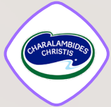
Charalambides Christis Ltd. (Cyprus) Audit and Assurance