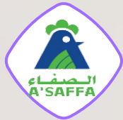
A'saffa Foods SAOG Advisory Services