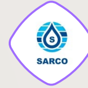
South American Restaurants Corp Audit and Assurance