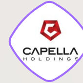
Capella Holdings Joint Stock Company Audit and Assurance