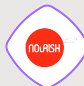
Nourish Group Limited Audit and Assurance