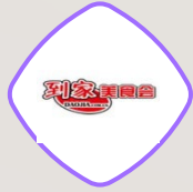
Beijing Daojia Times Catering Management Co., Ltd. Audit and Assurance