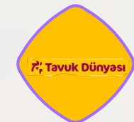
Tavuk Dünyası Gıda Sanayi ve Ticaret A.Ş. Audit and Assurance