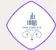
Hotel Dar Saïd and Restaurant Dar Zarrouk Risk Advisory