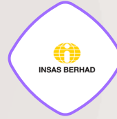
Insas Berhad Audit and Assurance