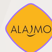
Alajmo Spa Tax Advisory