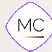
Mena Chambers Bahrain Tax | Advisory and Compliance