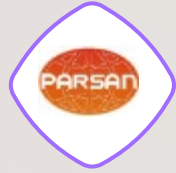
Parsan Overseas Private Limited Audit and Assurance