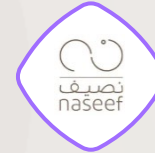
Naseef Restaurant W.L.L.