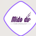
Mido du Café