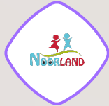
Noorland Hall for Entertainment