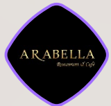
Villa Arabella Restaurant and Café W.L.L.