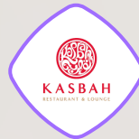
Kasbah Restaurant and Lounge