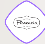
Florencia Ice Cream