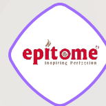
Epitome Restaurant and Coffee Shop