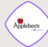
Applebee's Restaurant Bahrain