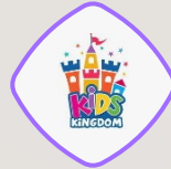
Kids Kingdom Entertainment W.L.L.