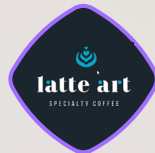
Latte Art Food and Beverage Co. W.L.L.