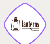
Lanterns For Restaurant Management W.L.L.